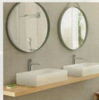
Bathroom [page 58]