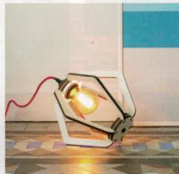
Lighting [page 86]