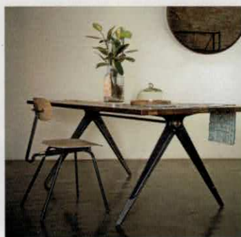
Dining room [page 46]