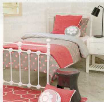
Children's room [page 74]