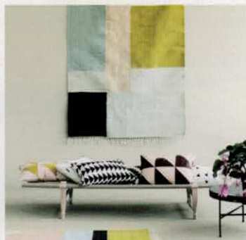
Rugs [page 84]