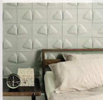
Bedroom [page 64]