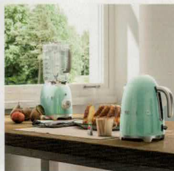
Kitchen [page 52]