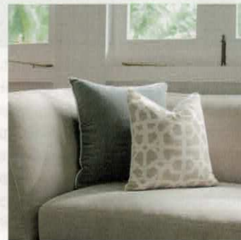
Accessories [page 88]