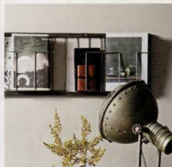
Storage [page 82]