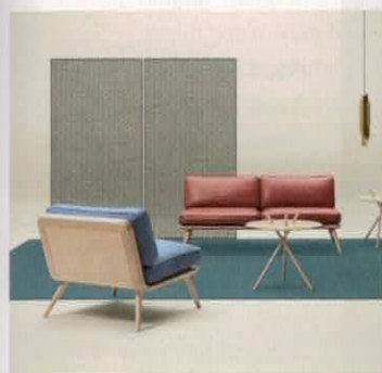
Living room [page 36]