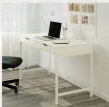
Study [page 68]