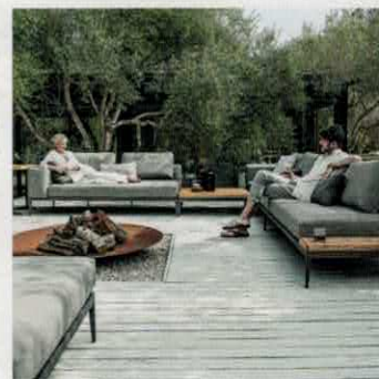
Outdoor [page 78]