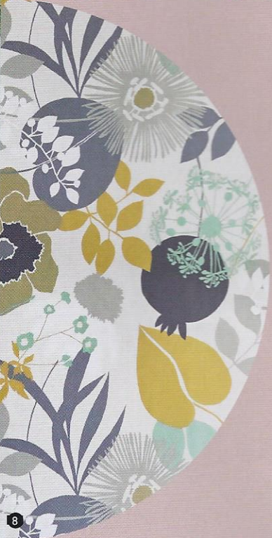
5 Lomasi by Remo, from Tatum.